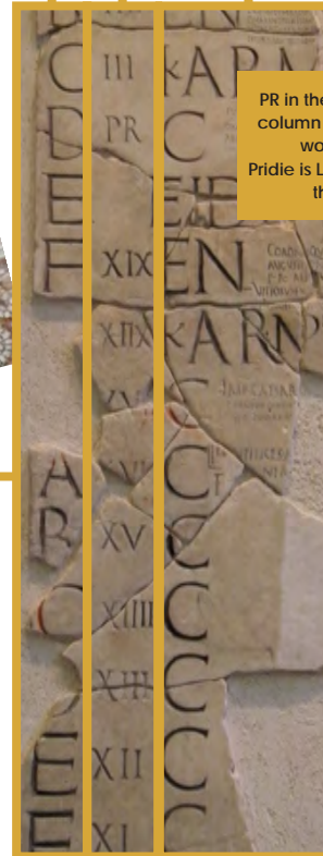
PR in the 'countdown' column stands for the word pridie. Pridie is Latin for 'before the day.'

Kalends, Nones, Ides, Holidays, etc. (Ides written EID)