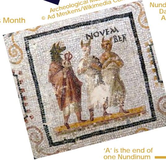
'A' is the end of one Nundinum AND the beginning of the next.