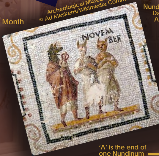
'A' is the end of one Nundinum AND the beginning of the next.

Countdown to next lunar phase. Nundinum Days A-H Kalends, Nones, Ides, Holidays, etc. (Ides written EID)